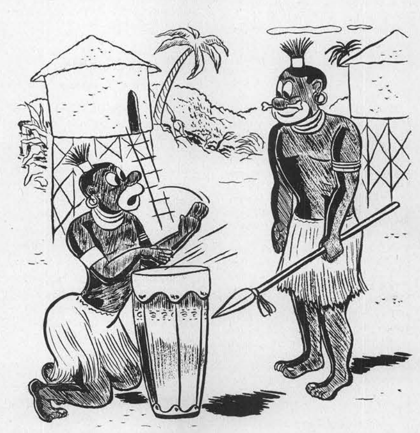
"I THINK I GOT THE LONG DISTANCE OPERATOR NOW!